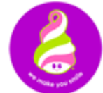
Menchie's Frozen Yogurt We make you smile. (USA)