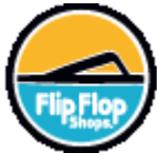
Flip Flop Shops Become part of the flip flop lifestyle. (USA)