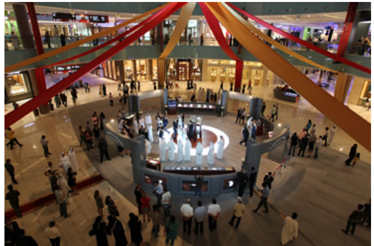
Mall of Dubai